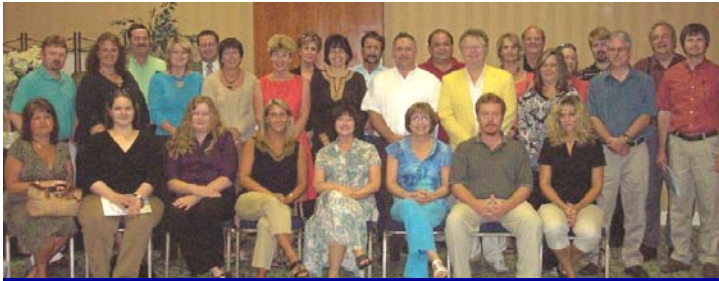
District Substance Abuse Specialists and Branch Managers at the SAV-R Training

OVR has been selected to pilot the “Substance Abuse in Vocational Rehabilitation – Screener” (SAVR-S) , an assessment tool used to identify potential problems related to substance abuse among vocational rehabilitation consumers. The Department of Substance Abuse Resource and Disability Issues at Wright State University developed the screener through a grant from the National Institute on Disability and Rehabilitation Research (NIDRR). Kentucky will begin a one-year pilot on October 1, 2007, along with Utah and Virginia. Illinois, Ohio and West Virginia began piloting the tool in the fall of 2006.