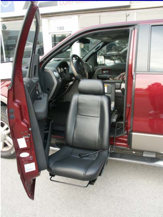
Nearly half of all KATLC loans are for vehicles and vehicle modifications. Loans for hearing aids are also frequently requested.

In FY 2008 the Kentucky Assistive Technology Loan Corporation (KATLC) received 119 applications and approved 75 loans for a total of $751,976.12 lent to individuals with disabilities. The majority (90%) of the loans were for hearing aids and vehicles and vehicle modifications.