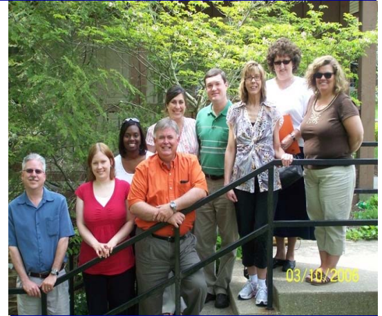
Staff from KY OVR's Bowling Green district take a break during 'Improving Vocational Goals through Counseling' training at Pennyrile State Resort Park.

The use of online training continues to be a focus of the agency with efforts toward moving segments of new employee orientation to a more efficient format. The implementation of this plan is made possible due to the utilization of Kentucky resources such as Kentucky Virtual Campus. Efforts to transition face-to-face trainings to this medium will continue in the upcoming year as the agency continues to focus on providing quality training in the most efficient method possible.