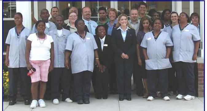
The staff of the Resident Inn Paducah by Marriott. The hotel works closely with local OVR staff on job placements.

Employers are offered assistance in hiring and retaining a skilled workforce, including access to a qualified applicant pool and financial incentives such as on-the-job training and tax credits. Job placement staff continues to develop many new partnerships with employers. More than 25 new partnerships with businesses were launched in 2008. The job placement staff in Louisville provided over forty disability awareness presentations to businesses this year. Lexington job placement staff has also provided Windmills Training for 100 employees.